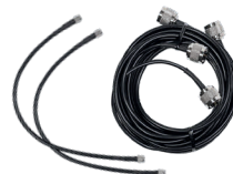
20' Conjoined N to N Cable & (2) 1' SMA to SMA Cables (CBL000144, CBL000141)