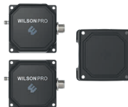
(2) Power Over Coax Units (ACC000084) & Bracket